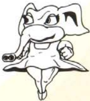
Bertha the Ballerina—200