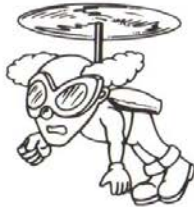
Baz the Bomber—150