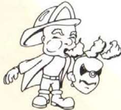
Franco the Fire Breather—200