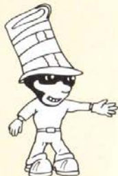
Colin the Crazy Clown—50