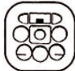
TRANSPOTER VL - 3X