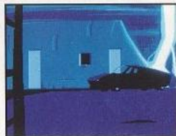
Lightning hits the laboratory

Plug in the game pak and turn on your Super Nintendo Entertainment System. After the Out of this World logo vanishes you may press any button to get to the Start / Continue screen. You may choose either Start or Continue by pressing up or down on the control pad. Select 'Start' and press 'B' to start the game. Once the game has started, push up on the control pad to swim to the surface of the water.