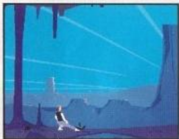
How to squash leeches

THIS SECTION CONTAINS HINTS THAT GIVE AWAY PARTS OF THE GAME. ONLY READ THIS SECTION IF YOU ARE STUCK!