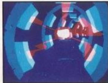
Lester's experiment goes wrong