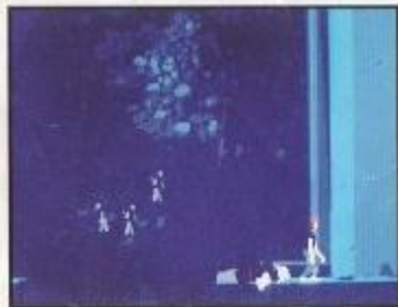
Picking up a much needed weapon

You make a super shot by holding down the button for a longer period of time.