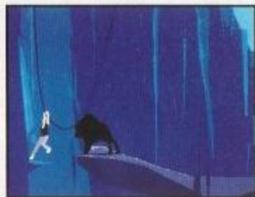
Hanging by a thread