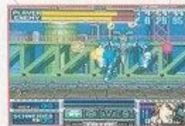
You should blast incoming enemy shots as soon as possible.

Each enemy has different weapons in its arsenal. You can intercept and block most types of enemy shots with a single turbo shot, but some may require additional shots. Any kind of attack can be intercepted with a fully charged blast. Block and counterattack to survive.