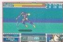
Special Weapon icons are located under the Weapon Power Meter.

You can also choose to use a Special Item, such as a Bomb, by pressing the Cursor button. Once you have selected the item you want to use, aim carefully and press the Fire button to use it. (See page 13 for a description of the special items. You will not have all of them at first.)