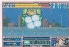
The Weapon Power Meter is located beneath the view screen.

Your main weapon is a laser. Each time you press the FIRE button, you will shoot a single shot. Like a machine gun, you can rapidly shoot these bolts, but this does little damage to the enemy. If you don't shoot, energy builds up in your gun and you can fire a powerful Energy Bolt!