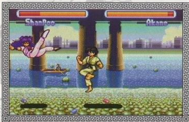
AKANE - FLYING KNEE KICK

Akane is surrounded as usual by a hoard of boys asking her for a date. Her daily routine is to blast them off with a single blow. She pleaded with the principal to impose tighter school discipline. As you might expect, the principal has come up with something a little different.