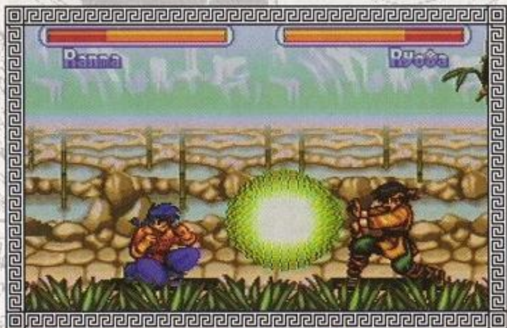
RYOGA - LION'S ROAR BULLET

Ryoga, the wanderer, accidentally lost his memory. He was taken in by the principal's slick talk and fooled into fighting faces from his past - even Akane, his heart-throb! What a loser!