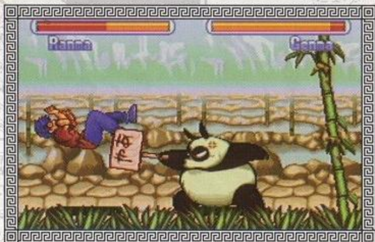
GENMA - SIGNBOARD PUNCH

Having a rebellious son like Ranma has been a big headache and heartache for Genma Saotome. After hearing the principal's pep talk, Genma resolved to achieve his ultimate strength by any means available. In this way he could demonstrate his paternal dignity to the world. Even if it means transforming into a Panda!