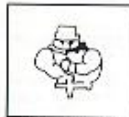
The Red Archer

Hurls dynamite out of windows. Use your "super jump" to hit him — win bonus points!