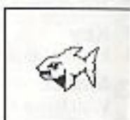
The Killer Piranha

Iron Arms tosses his iron arm, avoiding the player's attack with his own shield. Be aware that the arm is returning.