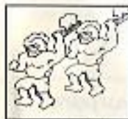
The Hatchet Brothers

They appear simultaneously to attack you with axes. The best way to defeat them is to defend yourself with your shield.