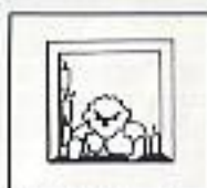
The Mad Bomber

Comes out of manholes using crossbow to attack. You get bonus points when you stay the Hidden Archer.